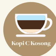
Kopi C Kosong

Coffee with evaporated milk, unsweetened