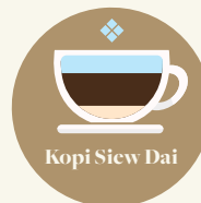
Kopi Siew Dai