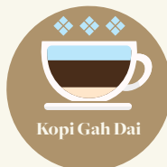
Kopi Gah Dai